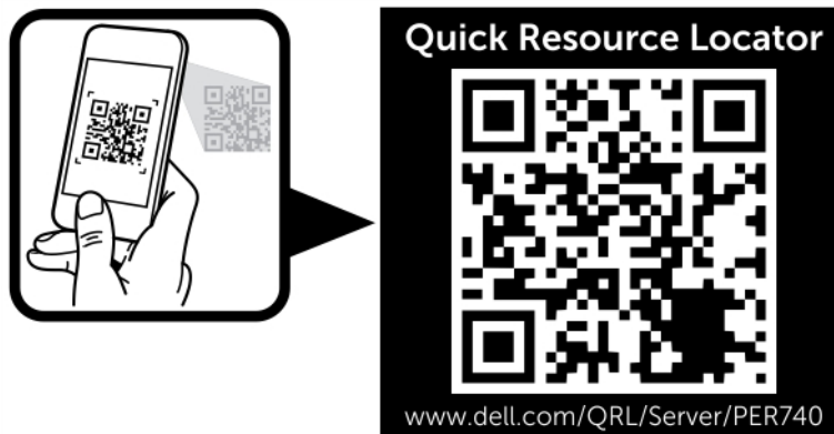
Figure 2. Quick Resource Locator for PowerEdge R740 and R740xd systems